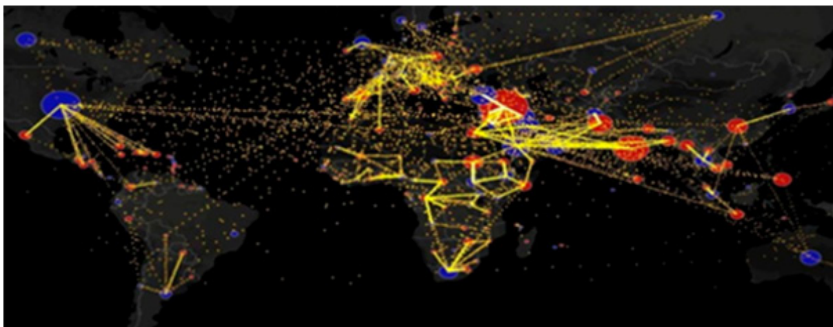
Figure 1 – Immigration and emigration flows in the world from 2010 to 2015